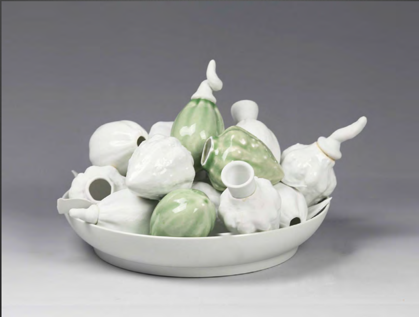
Piante 51 , 2016, Jingdezhen porcelain, slip cast, industrial plate, 20 cm high x 33 cm diameter