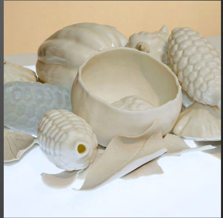
Piante 46, 2014 porcelain, slip cast, cast glass, luster, LED lit pedestal top 11 x 38 x 38 cm