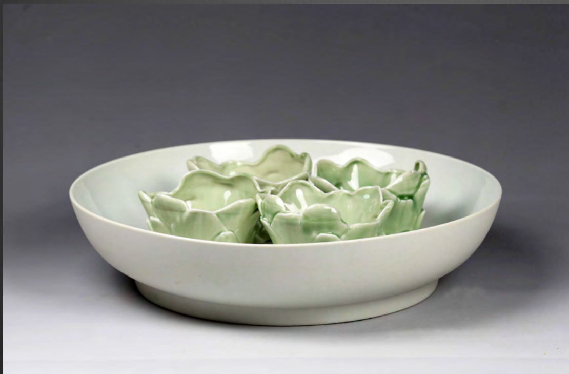
Piante 50 , 2016 Jingdezhen porcelain, slip cast, industrial plate 20 cm high x 33 cm diameter