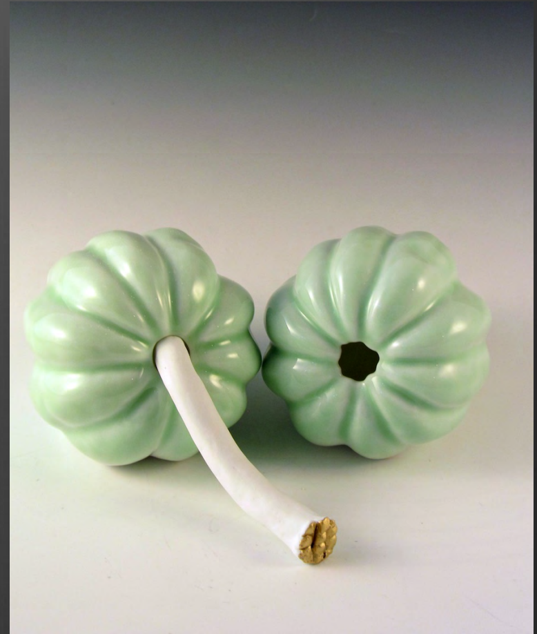
Piante 38, 2012, Jingdezhen porcelains, slip cast, luster, 13 x 25 x 23 cm