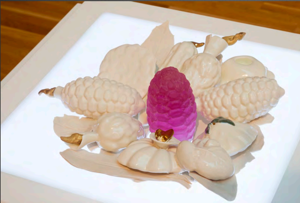
Piante 47, 2014 porcelain, slip cast, cast glass, luster, LED pedestal top 11 x 38 x 38 cm