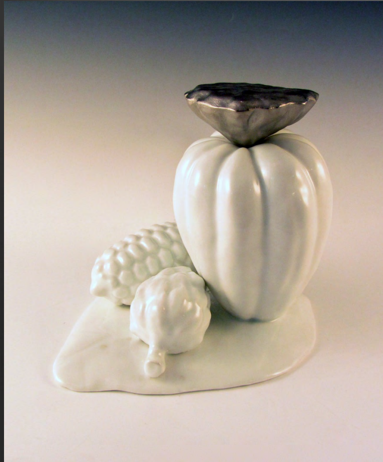
Piante 42, 2012, Jingdezhen porcelain, slip cast, PVD, 19 x 18 x 18 cm